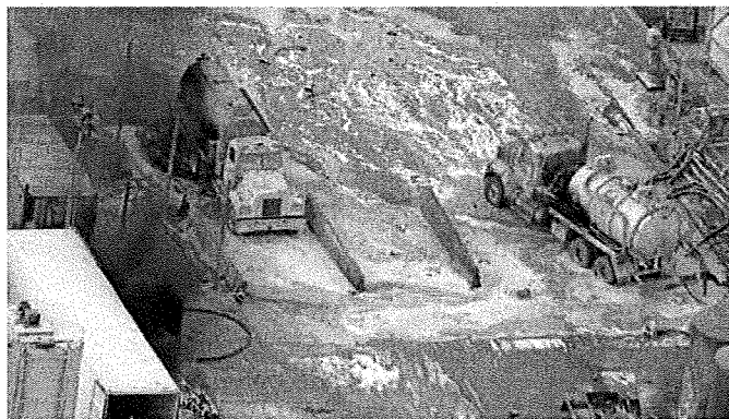
The explosion that occurred at the Santa Clara Waste Water Company on November 18, 2014 and its aftermath.