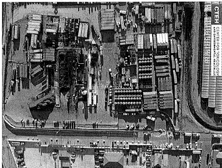
Aerial photograph of the Santa Clara Waste Water Company