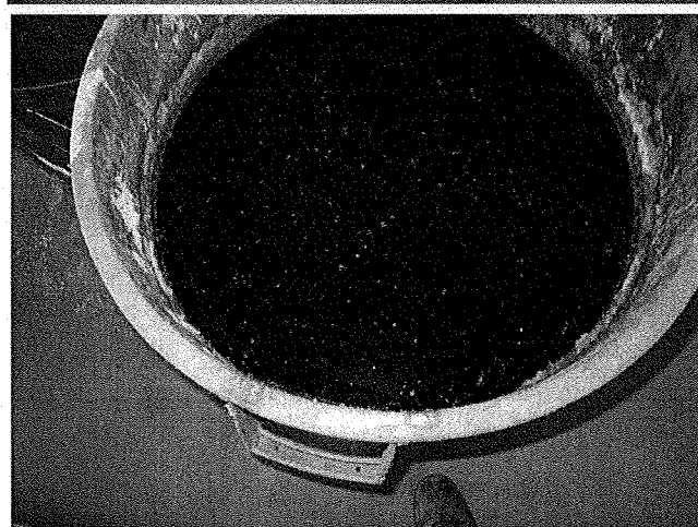
Plating wastes illegally stored at the Large Car LLC facility. The top picture shows EPA scientists sampling the waste.