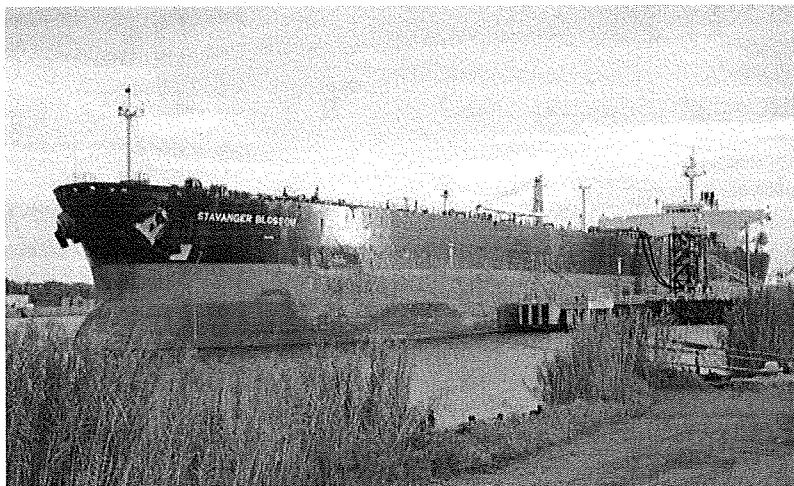
The M/T Stavanger Blossom

-- On November 10, 2015, a federal jury in the U.S. District Court for the Southern District of Alabama convicted DET STAVANGERSKE DAMPSKIBSELSKAB AS (DSD Shipping) and three