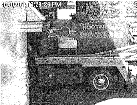
Still Images from Surveillance Video

The case was investigated by EPA’s Criminal Investigation Division with the assistance of the city of Hayden, the Hayden Area Regional Sewer Board, the FBI, the U.S. Forest Service, U.S. Secret Service, and the Kootenai County Sheriff’s Office.