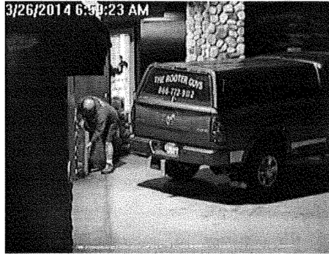
Still Image from Surveillance Video