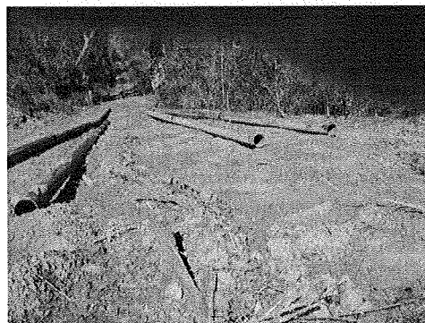
Asbestos Coated Pipeline

removed, and caused others to remove, several thousand feet of pipeline which contained regulated asbestos containing material, between Diana and Ore City, Texas. The excavation, cutting and removal of the pipeline, as directed by Beshears, included no wetting of the asbestos material that coated the pipeline as Beshears had been instructed during the training. The asbestos material was crumbled and pulverized by hitting the pipe coating with a hammer to knock it off the pipe to expose the pipe so it could be cut into pieces; asbestos was crumbled and pulverized by dragging the pipe segments across the ground; and asbestos was not disposed of at approved disposal facilities. Beshears was indicted by a federal grand jury on September 3, 2014.