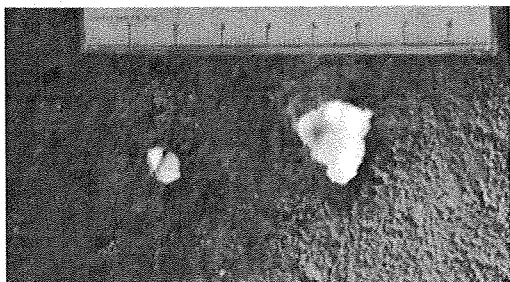
Holes in Freedom Industries crude MCHM Tank

On January 9, 2014, a major chemical leak was discovered in Charleston at the above-ground storage tank area owned and operated by Freedom Industries (Freedom) on the Elk River. Freedom used these storage tanks to keep and process chemicals, and the leak consisted primarily of 4-methylcyclohexane methanol (MCHM), a chemical used in the coal mining industry as a cleansing agent. A significant amount of MCHM leaked into the Elk River, flowed into a water treatment plant, and contaminated the water supply of Charleston and the surrounding areas for several days. Freedom did not have a permit required by law that would have allowed the company to discharge MCHM into the Elk River.