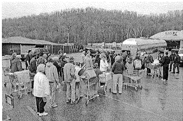
Charleston Residents Waiting for Drinking Water

Freedom had a permit issued by West Virginia's Department of Environmental Protection that allowed for the discharge of storm water and groundwater subject to monitoring and reporting requirements. However, this permit did not allow for the discharge of MCHM, and required the development and maintenance of a storm water plan and a groundwater plan. Generally, storm water and groundwater plans identify potential sources of pollution and outline steps to prevent, contain, and reduce pollutants.