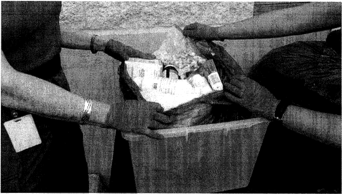
Figure 1: Collected household pharmaceuticals and their packaging prior to being burned in a burn barrel. Pharmaceutical packaging can include plastic, glass, multi-laminate films, cardboard, etc.