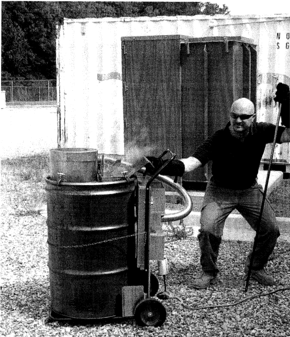
Figure 3: Collected household pharmaceuticals being burned in a burn barrel with a fan.

Photo used with permission of Forsyth Herald