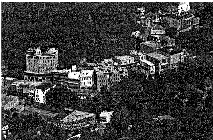
Aerial View of Eureka Springs.